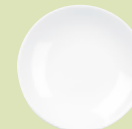
Coupe Bowl APRB AC8 20.3cm 8"