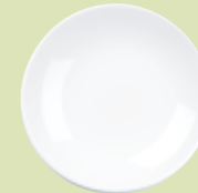
Coupe Plate APRB AC58 26.cm 10 1 / 8 "