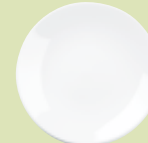
Coupe Plate APRB AC6 16.5.cm 6 1 / 2 " APRB AC9 23.0cm 9"