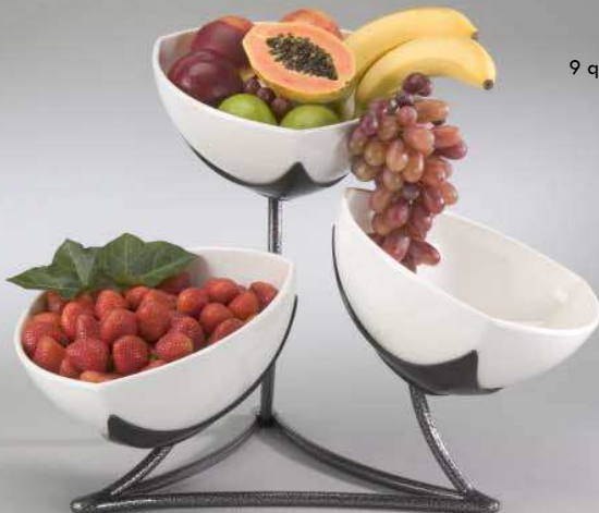
SR LOTUS TIER M Lotus Bowl Set w/ Metal Stand (W) 20"-51 cm • (L) 17"-43 cm • (H) 16"-40½ cm • 8¾ lbs-4½ kg