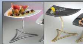
SR TRI SET M Triangle Melamine Platter set w/ Metal Stands (W)17½"-43¾ cm • (L)17½"-43¾ cm • (H)15"-38 cm • 20¼ lbs-10½ kg

Individual stands with bowls available Short - SR SQU SH M - Medium - SR SQU MD M - Tall - SR SQU TL M -