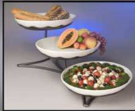
SR OVAL TIER M Oval Melamine Bowl set w/ Metal Stand (W)15"-38 cm • (L)29"-73 cm (H)12½"-31¼ cm • 16 lbs-8 kg