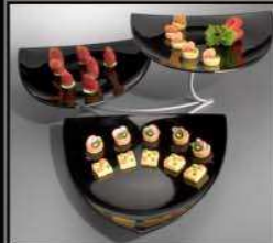
SR TRI TIER M Triangle Melamine Platter set w/ Metal Stand (W)30"-76 cm • (L)32"-81 cm • (H)10"-25½ cm 15½ lbs-8¼ kg