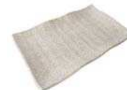
Eggshell Melamine Wavy Platter