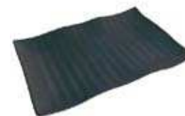
Black Melamine Wavy Platter