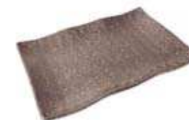
Black Granite Melamine Wavy Platter