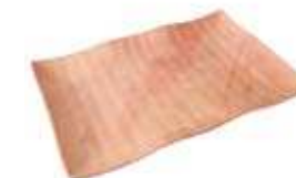
Pink Marble Melamine Wavy Platter