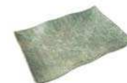
Green Marble Melamine Wavy Platter