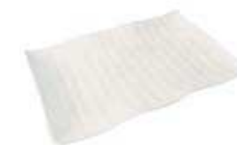
White Melamine Wavy Platter